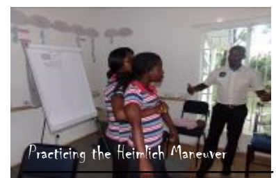
Practicing the Heimlich Maneuver