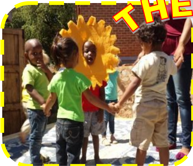
SINGING ...'THE EARTH(S) GO AROUND THE SUN'