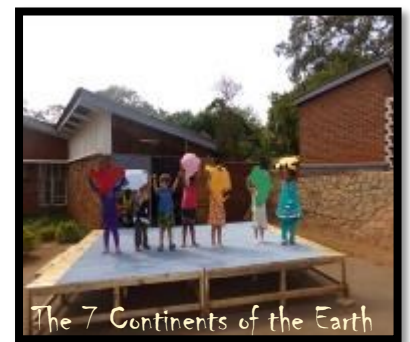
The 7 Continents of the Earth

A big pat on the back to our parents for all the lovely costumes