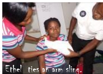
Ethel ties an arm sling.

The Participants were given a written and Practical exam after which they were awarded the internationally recognized First Responder Certificate issued by The Council of St Johns Ambulance UK.