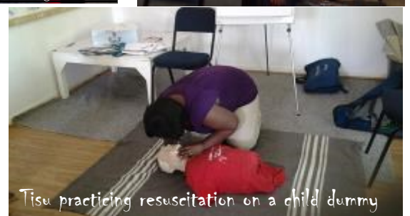
Tisu practicing resuscitation on a child dummy