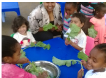
Cleaning the vegetables

Pretend cooking was also part of the excise.