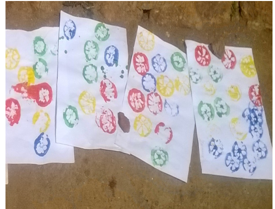
Lemon printing was the exciting moment for the week.