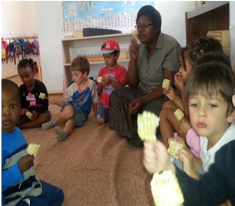
Eating Fresh Corn a plant originating from North America

We learnt about the seven Continents in Term 1 and now it was time to explore some of the Continents in detail. We started with North America .