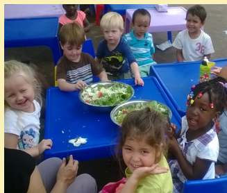
We love our salads!!