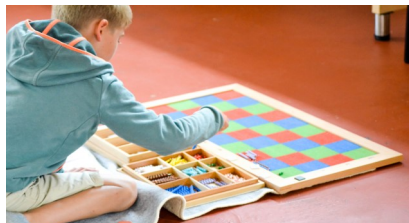
Montessori approach to multiplication which help the child to internalize the process before moving to abstract way of doing multiplication