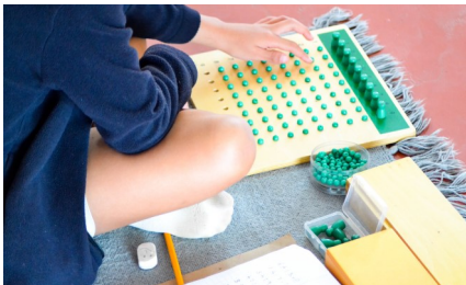
Montessori approach of introducing division/ repeated subtraction

Lili's Montessori School uses a unique Montessori approach to learning that help the child to develop the love of learning , respect for others as well as humanity and develop self confidence.